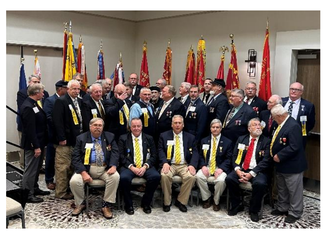
Our SUVCW National officers for 2023.