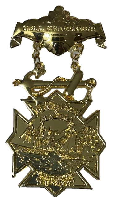
National Encampment medal commemorating the USS Kearsarge's victory over the CSS Alabama at Cherbourg, France.

The Department of New Hampshire hosted the 142<sup>nd</sup> National Encampment at Nashua, New Hampshire. The Brothers from New Hampshire put on a very well orgainzed encampment and we thank them for their excellent hospitality that made for a very enjoyable time. As always, it's