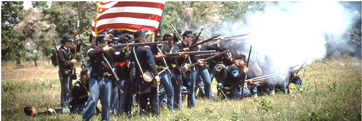
Battle of Honey Springs Reenactment