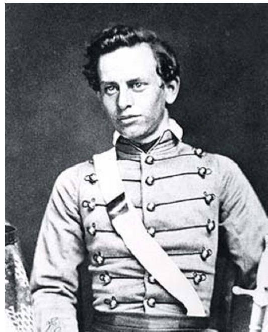
Henry M. Roberts as a West Point graduate shortly before the 'Pig War.'

Anyway, the US sent an officer to the island to build a defensive redoubt on our end, and that officer was West Point graduate 2 nd Lt. Henry Martyn Robert. He built such a strong position that the English didn’t challenge it. Lt. Roberts went on to become a general in the Army of the Potomac during the Civil War.