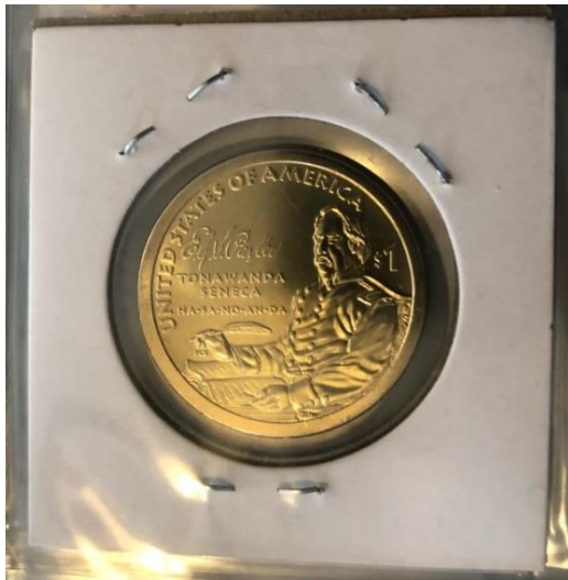
Another Piece of Civil War History

-----0----- Individuals attending events hosted by the Sons of Union Veterans of the Civil War, by virtue of their attendance, agree to the usage of their likeness in the Banner, any Camp or Department Newsletter, any SUVCW website and/or on any SUVCW Social Media outlet, promotional brochures, or any other SUVCW material.