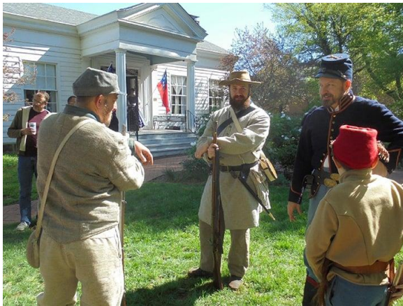
Re-enactors converse in front of the Headquarters House in Fayetteville, AR.

Individuals attending events hosted by the Sons of Union Veterans of the Civil War, by virtue of their attendance, agree to the usage of their likeness in the Banner, any Camp or Department Newsletter, any SUVCW website and/or on any SUVCW Social Media outlet, promotional brochures, or any other SUVCW material.